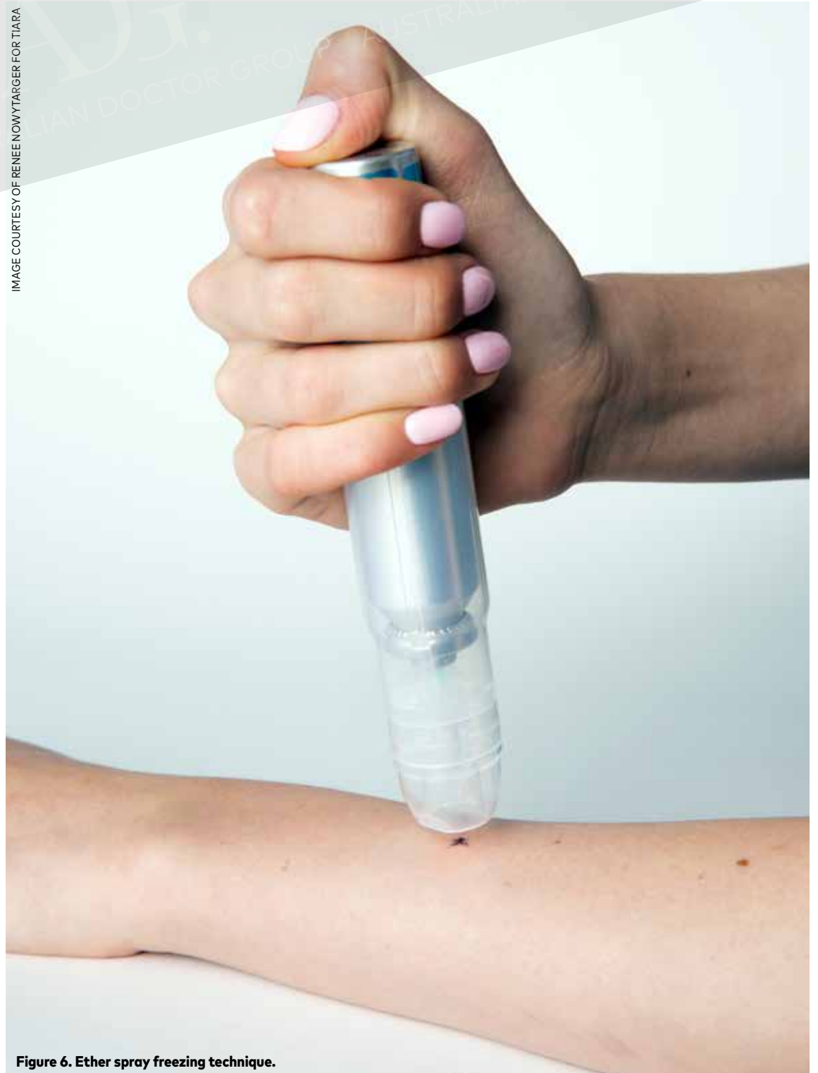
Figure 6. Ether spray freezing technique.