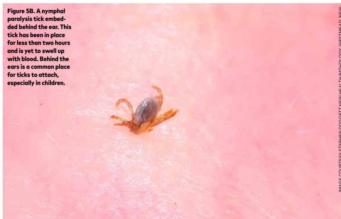
Figure 5B. A nymphal paralysis tick embedded behind the ear. This tick has been in place for less than two hours and is yet to swell up with blood. Behind the ears is a common place for ticks to attach, especially in children.

sIgE over 18 months to two years, and after 3-4 years many those with MMA may tolerate mammalian meats again, provided there has been no further tick bite from