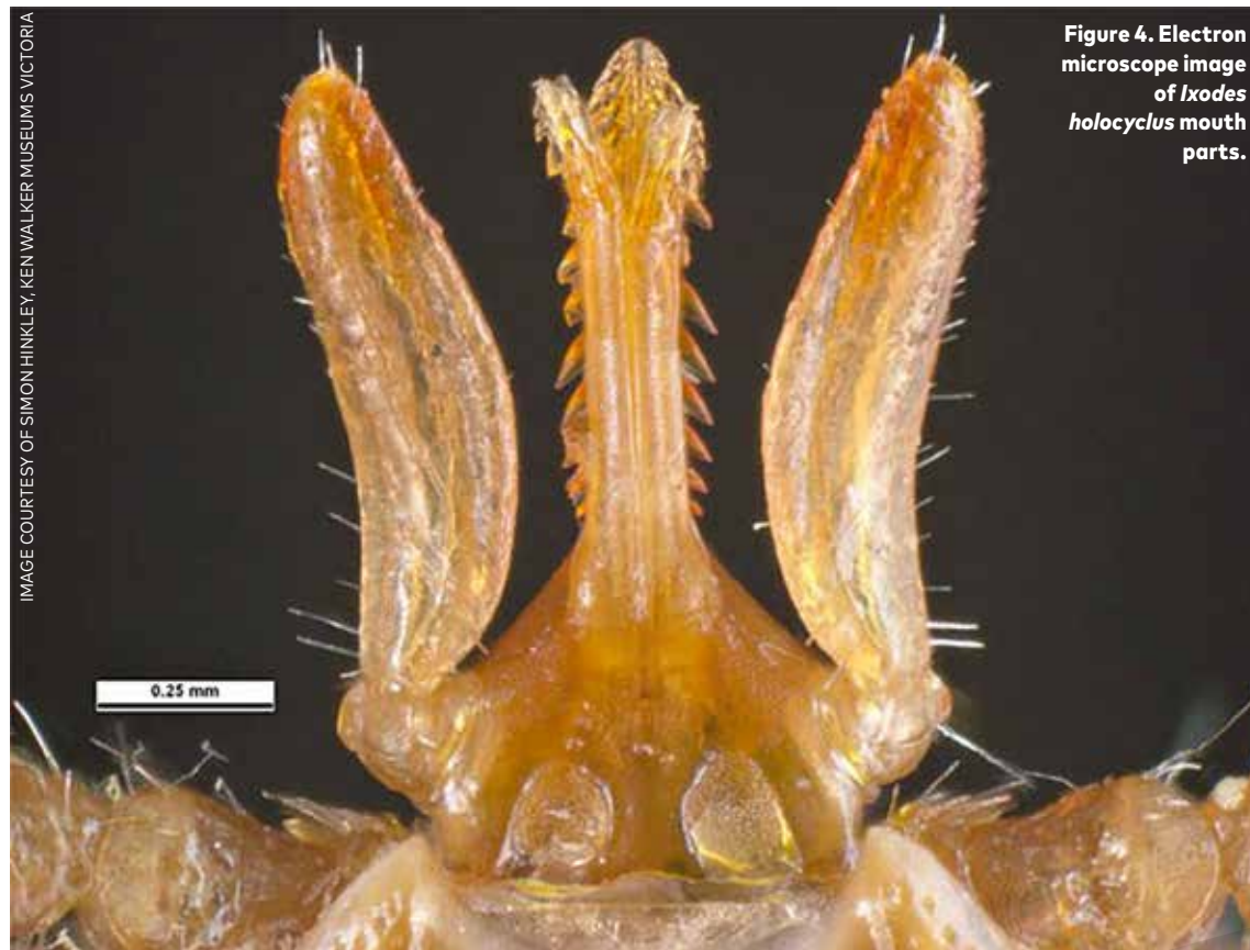
Figure 4. Electron microscope image of Ixodes holocyclus mouth parts.

Recent work noted a significant reduction in the level of alpha-gal