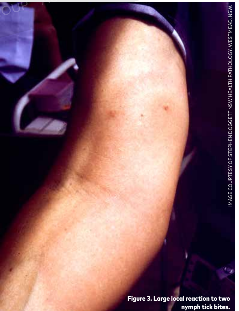
Figure 3. Large local reaction to two nymph tick bites.

the anaphylaxis does not occur until the tick has been disturbed or compressed. Because the tick injects the allergen into the circula-