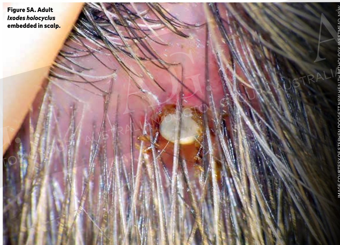
Figure 5A. Adult Ixodes holocyclus embedded in scalp.