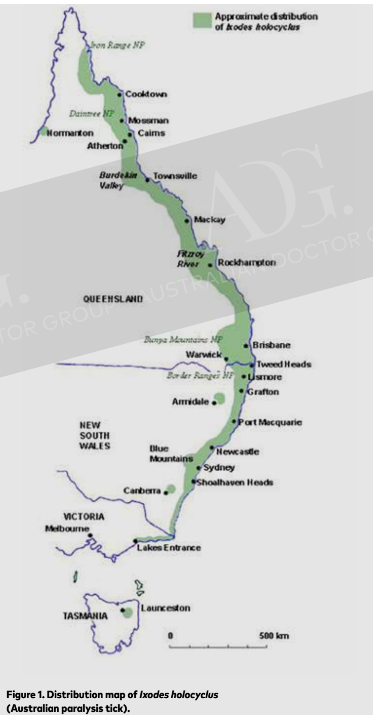
Figure 1. Distribution map of Ixodes holocyclus (Australian paralysis tick).

considered to be due to tick salivary protein sIgE activating dendritic cells, mast cells and basophils in the skin, causing release of inflammatory mediators, as occurs in all classical allergic reactions (see figure 3).